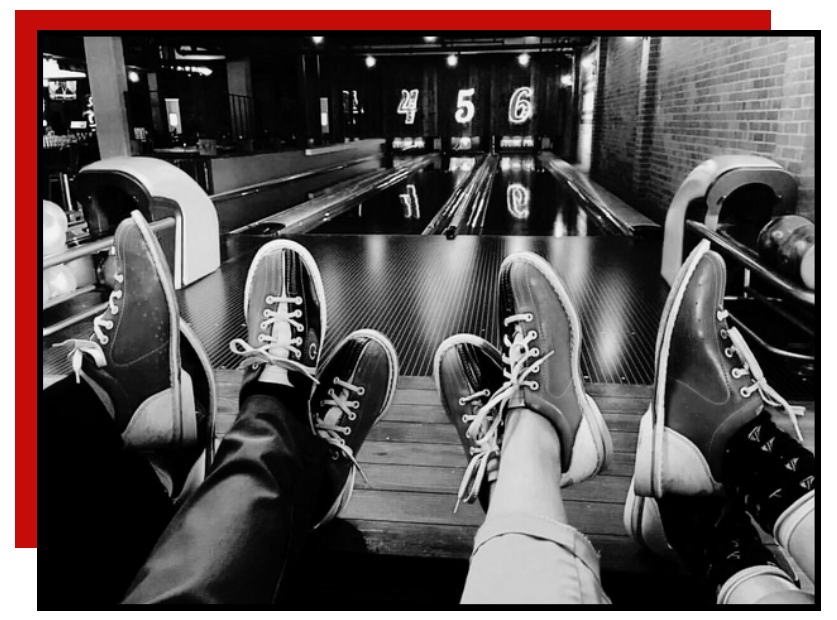
*Holiday pricing may vary. Pricing does not includes taxes or entertainment/service fee (20%)

FRIDAY - MONDAY: $2500 TUESDAY - THURSDAY: $2000 $500 per additional hour